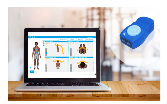
Figure 1. Mobeemed device