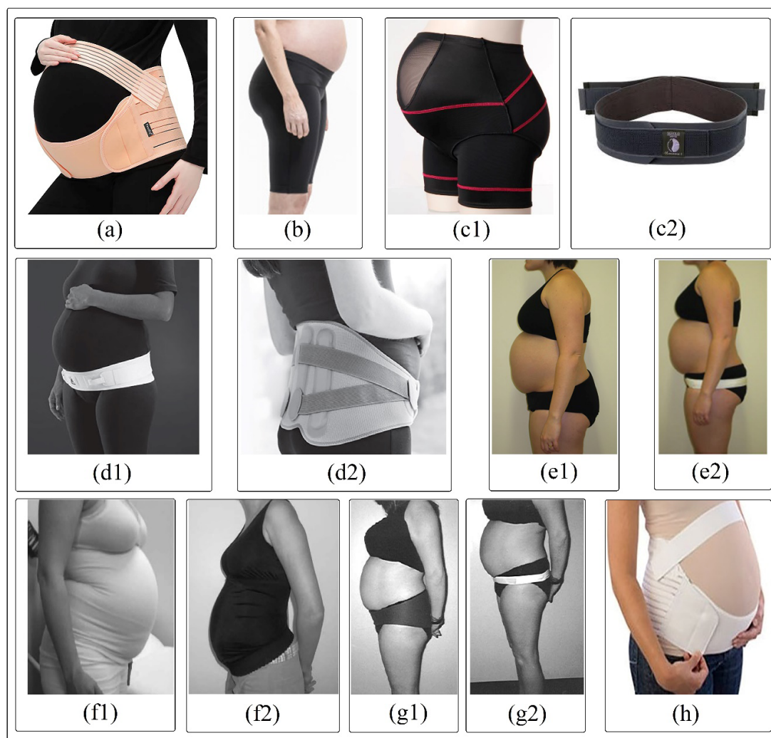
Figure 2. A summary of the used pelvic belts in eligible studies

a: 3M nexcare [34]; b: Elastomeric DEFO [36]; c1: Elastomeric DEFO [43]; c2: Rigid SEROLA [43]; d1: Narrow and flexible belt [37]; d2: Wide and rigid belt [37]; e1: Wide and flexible belt [38]; e2: Narrow and rigid belt [38]; f1: Tubigrip [29]; f2: BellyBra [29]; g1: Wide and flexible belt [35]; g2: Narrow and rigid belt [35]; h: Loving comfort back support [44].