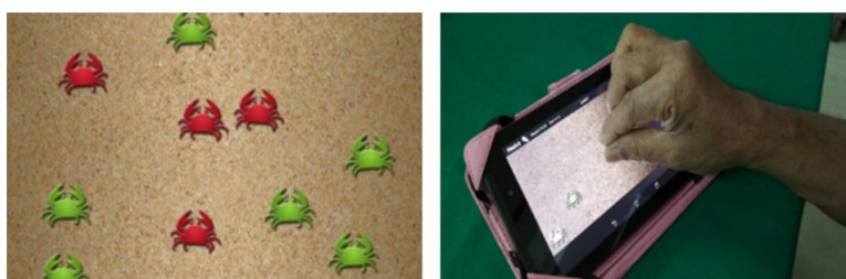
Figure 2. Pinching of objects