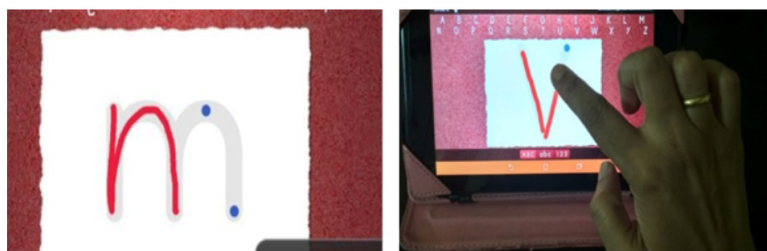
Figure 3. Scribble and tracing of alphabets or shapes