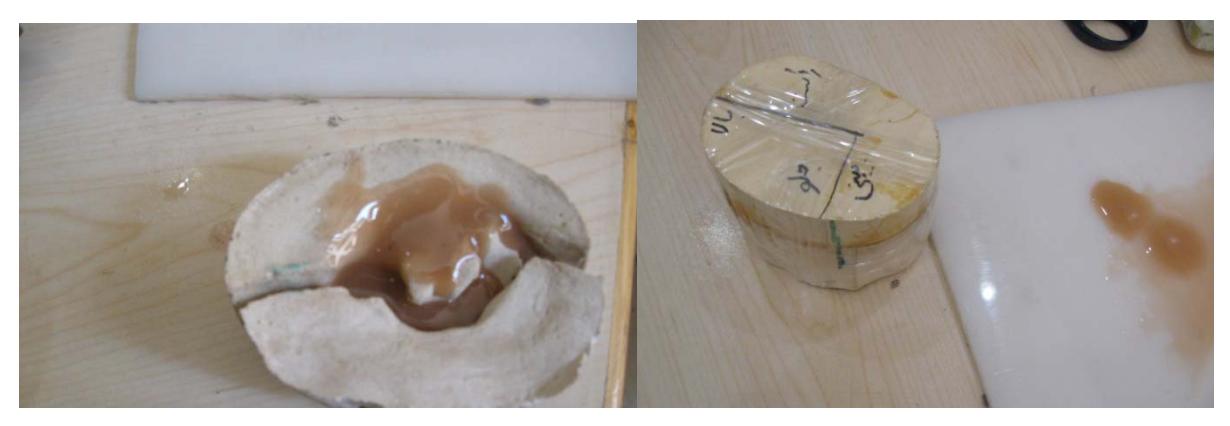
Fig 6. Colour matching and silicone pour

The silicones were mixed with the hardener and then poured into the mold, which was then closed tightly. After 24 hours, the mold was opened and the ear prosthesis was carefully removed.