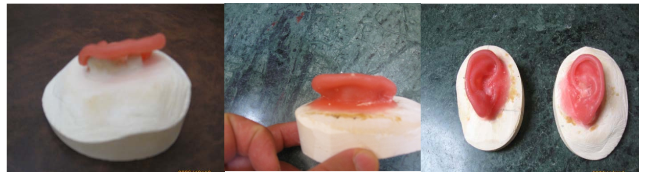
Fig 4. Plaster bases with wax models attached

maximum aesthetic appearance and functional application. For the left ear, approximately 20 percent of the plaster base was modified, in order that the finished silicone ear would have effective self-suspension, without the need for adhesive. Then, the wax shell was put on the left ear until it was completely covered with wax to produce two very similar wax moulds.