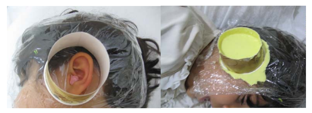
Fig 3. Alginate being used to create negative impression of donor ear