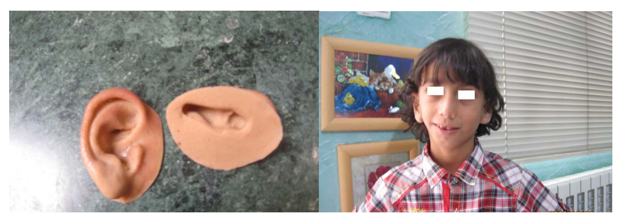
Fig 6. The final prostheses; as manufactured (left) and fitted to the patient (right).