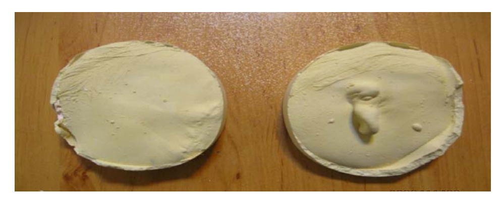
Fig 2. Right and left plaster bases, replicating the patient's prosthesis attachment sites

Similarly, impressions were formed from the donor were ears made using the same alginate (figure 2) and