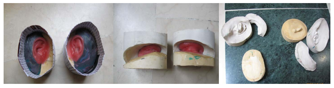
Fig 5. Construction sequence of three piece mold

removed intact, before being replicated in plaster (see fig 5). This effectively left a three piece plaster mold, once the original ear wax was melted out, leaving a negative impression within the mold of the ear structure plus the attachment that would be needed to affix the ear to the affected site.