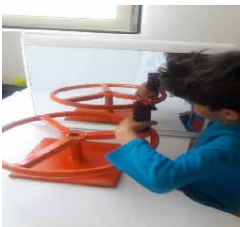
Iranian Rehabilitation Journal

Figure 1. Rotating the wheeling shoulder with non-affected hand in front of mirror