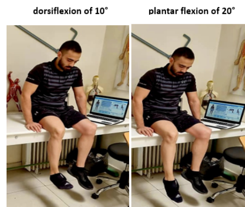
Iranian Rehabilitation Journal

The test was repeated three times for each target angle. The subjects sat on a chair in such a way that the angle of the trunk with the thigh and the thigh with the knee was at 90° to measure the ankle proprioception. The height of the seat was adjusted so that the subjects' soles did