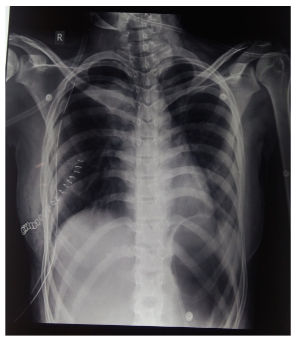
Iranian R∈habilitation Journal