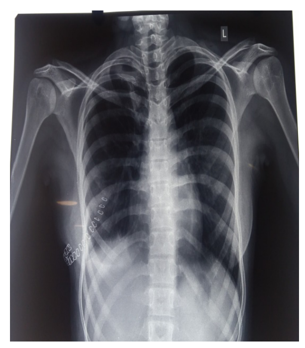
∏ranian R∈habilitation Journal

The limitations of this study were that preoperative physiotherapy and physiotherapy management for pain reduction, like transcutaneous electrical nerve stimulation was not provided to the patient. Also, analgesics and their dosage - which had and influence on the pain outcome - were not recorded. Furthermore, the long-term effect of the protocol on the patient was not assessed. Further evidence is required to determine the effect of individualized exercise programs on post-operative pulmonary complications and functional capacity in post-operative pleurectomy and other thoracic surgeries.