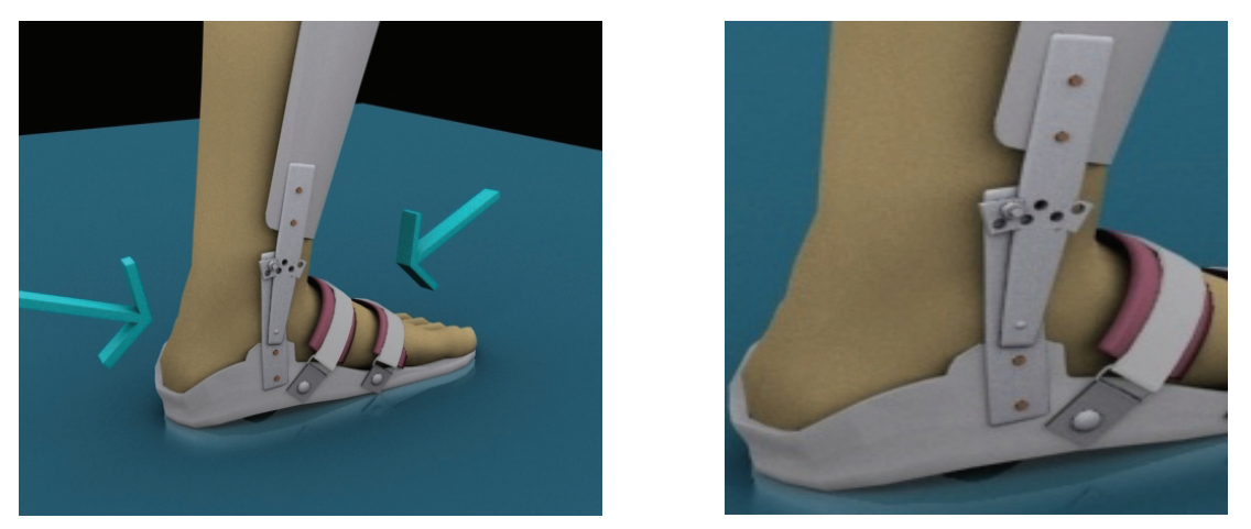
Fig 1. Views of the modified FRAFO introduced by Bahramizadeh et al (17).

walkway during data acquisition. The resulting data were calculated by averaging data from both left and right sides for the five walks with the orthosis. Orthoses were used bilaterally by all subjects.